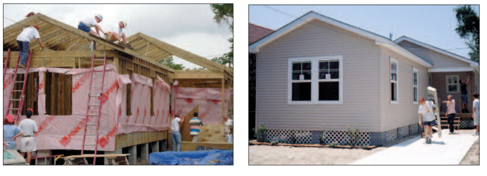
Habitat for Humanity constructed its first all-treated wood home in New Orleans. The raised floor design (1050 sq. ft.) called for 8,500 board feet of KDAT Southern Pine lumber and plywood.

The use of pressure-treated wood offers homeowners the most practical, cost-effective and safest way to fully protect framing components from termites or fungal decay.