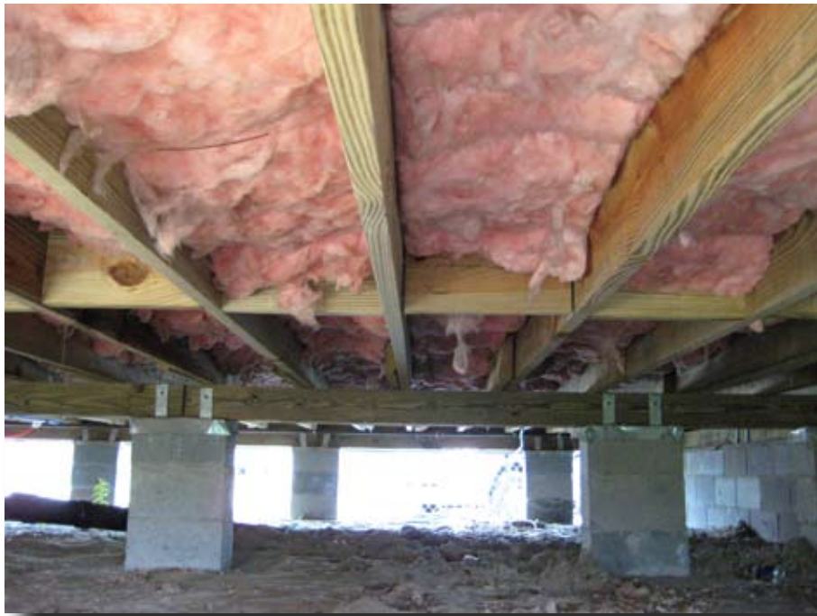
Figure 4d. Example of typical fiberglass batt insulation.