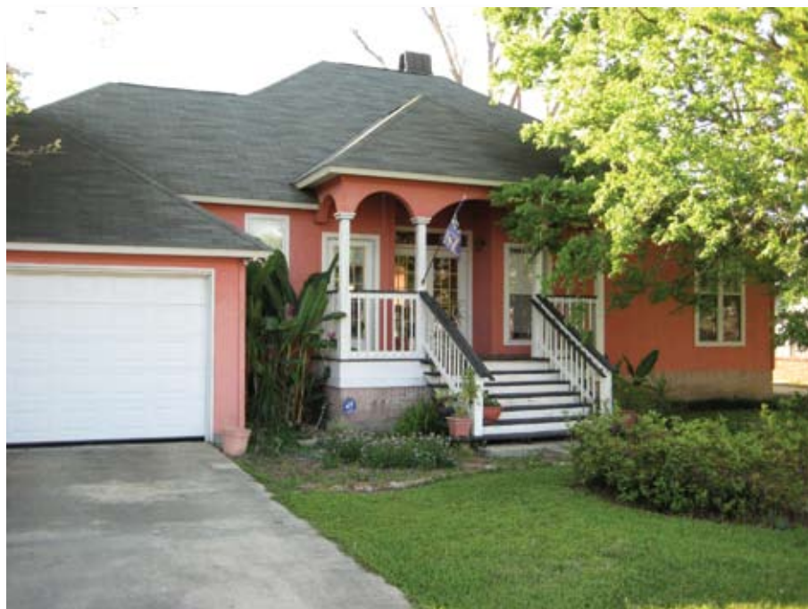
Raised floor home in Baton Rouge

In contrast, if the floor finish was vinyl, the vapor retardant paint applied over open cell foam appeared to result in lower subfloor moisture contents on average (relative to an otherwise identical floor system with the vapor retardant paint omitted), but some individual moisture readings still exceeded 16 percent moisture content. The data regarding the effect of vapor retardant paint were not conclusive, and further research is needed to determine whether the combination of open cell foam and vapor retardant paint can be a reliable strategy for preventing summertime moisture accumulation in subfloors in this climate.