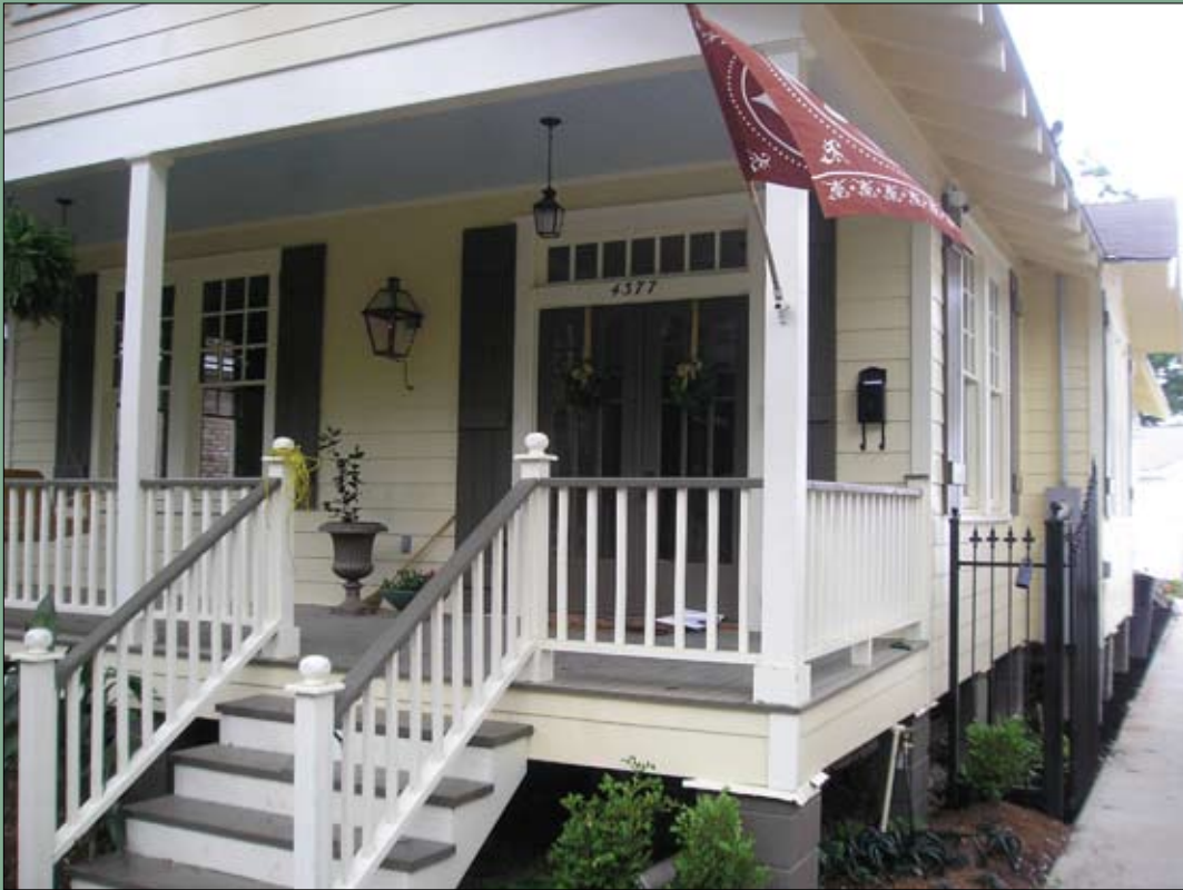
Raised floor home in Baton Rouge

Research Findings on Moisture Management