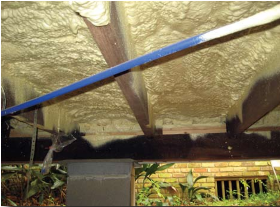
Figure 4b. Example of closed cell spray foam.

The sample of 12 houses included six different insulation systems: