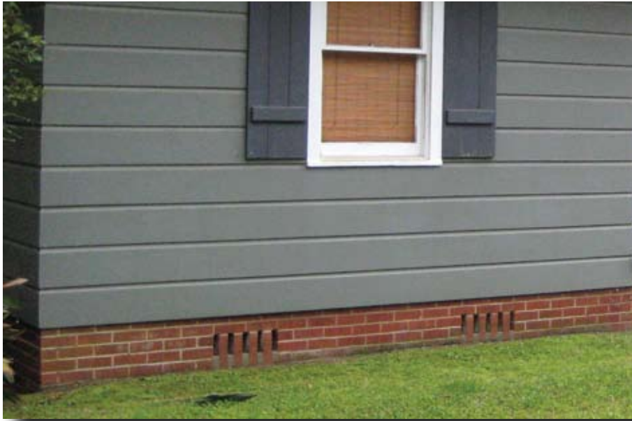
Figure 2. Example of a wall-vented crawl space.

of construction is not typical and is risky in flood hazard areas.