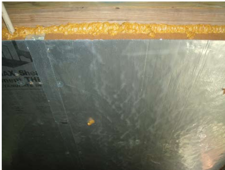
Figure 4a. Example of rigid, foil-faced polyisocyanurate foam.

Air temperature and humidity were measured with data loggers placed indoors, outdoors and in crawl spaces. Moisture content and temperature of the wood or plywood subfloor was measured, typically twice each month. Monitoring started in October 2008 and concluded in October 2009.