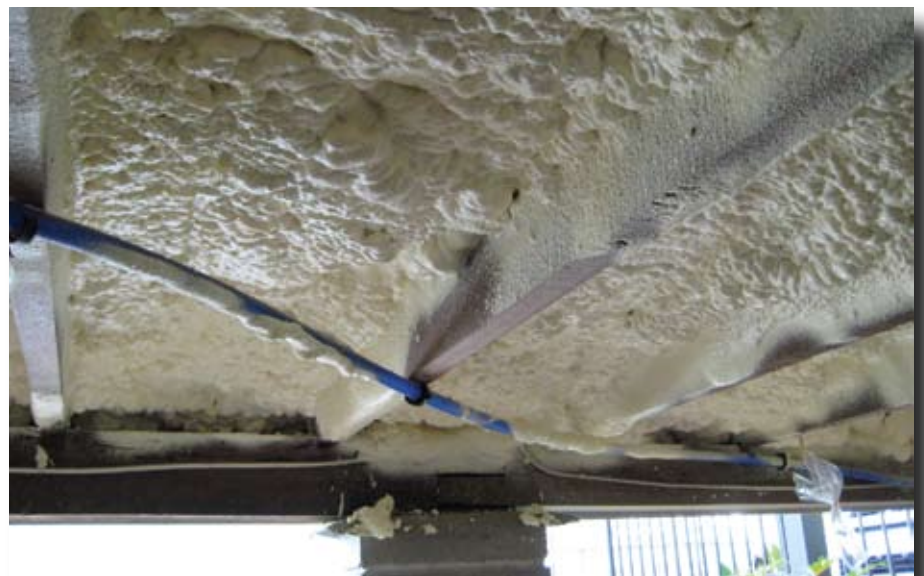
Figure 4c. Example of open cell spray foam.