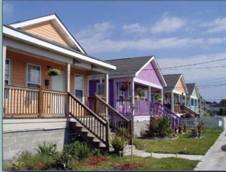
Raised floor homes in New Orleans