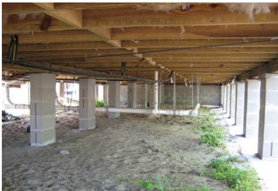
Figure 1. Example of an open crawl space.

The rates of wetting and drying of building assemblies, whether they are floors, walls or ceilings, can be affected by thermal insulation. The job of thermal insulation is to slow down heat flow – to help keep the inside of the house warm when it's cold outside and cool when it's hot outside. In addition to its thermal resistance, insulation provides some resistance to moisture migration, and this resistance can vary widely between different types of insulation. Insulation's effect on limiting heat flow will coincidentally make certain parts of the floor assembly warmer (or cooler) than other parts of the assembly. This is important because wood tends to dry when it is warm relative to its surroundings and is prone to moisture accumulation when it is cooler than its surroundings.